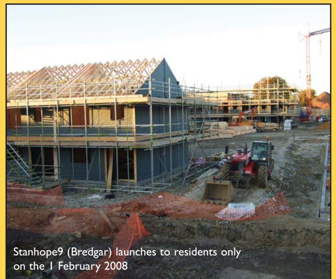
Stanhope9 (Bredgar) launches to residents only on the 1 February 2008